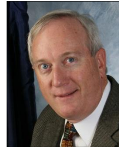
& Commissioner (ex officio) (Erlanger)